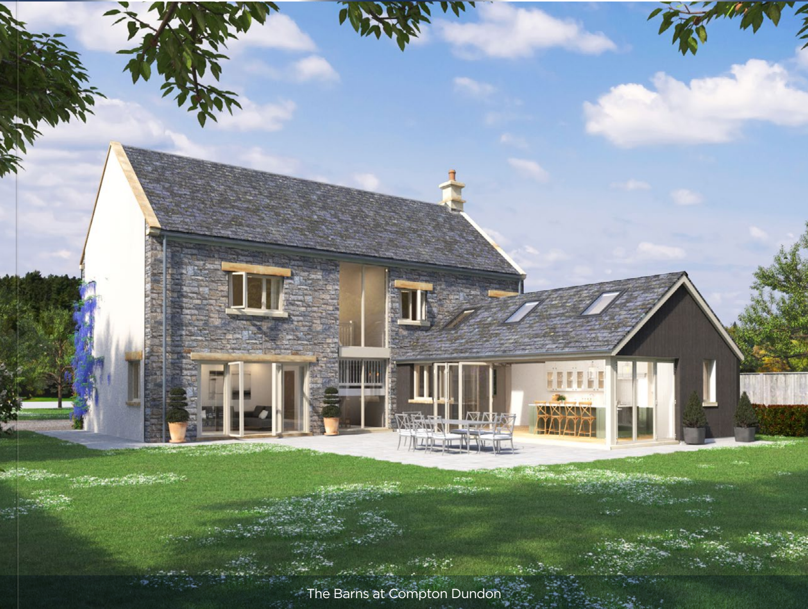
The Barns at Compton Dundon